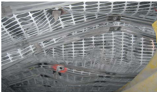
Tensor Roof Mats have greater surface area coverage which dramatically reduces the occurrence of rock fall through.

When soft bottom conditions require effective base reinforcement, the Spectra® Roadway Improvement System, featuring Tensor® TriAx® Geogrid, is the solution. A layer of TriAx Geogrid covered with the appropriate aggregate distributes wheel loads over a wide area to increase bearing capacity and extend service life. TriAx Geogrid also reduces the aggregate thickness required. And unlike poured concrete pads, no special equipment is needed for installation. Tensor Geogrids have routinely supported 50 ton loads underground as well as 150 ton load surface applications.