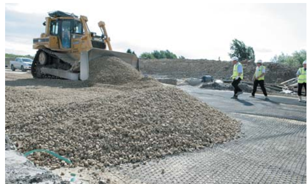
The Spectra Roadway Improvement System is engineered to reinforce soft soils and distribute heavy loads for both paved roads and unpaved haul roads.