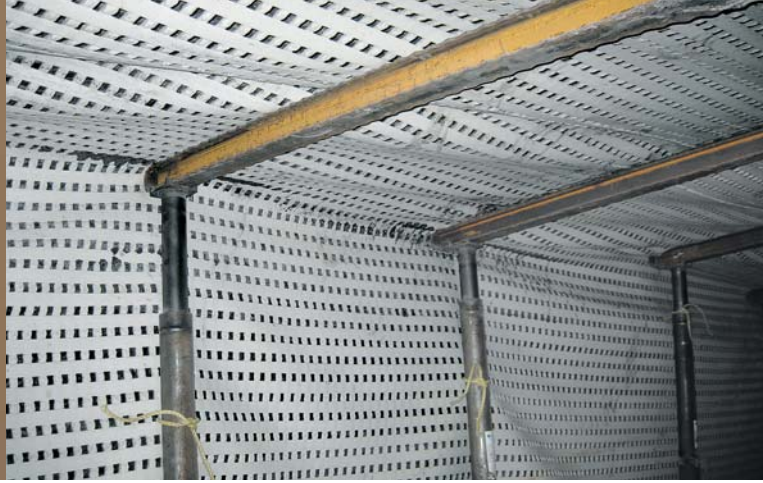
Minex™ 400 x 400 KN Mesh Screen