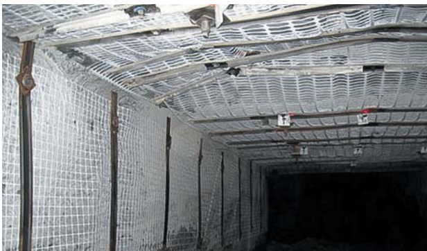
Tensar Mining Grids and UX Roof Mats provide effective rib and roof control for the most demanding applications.