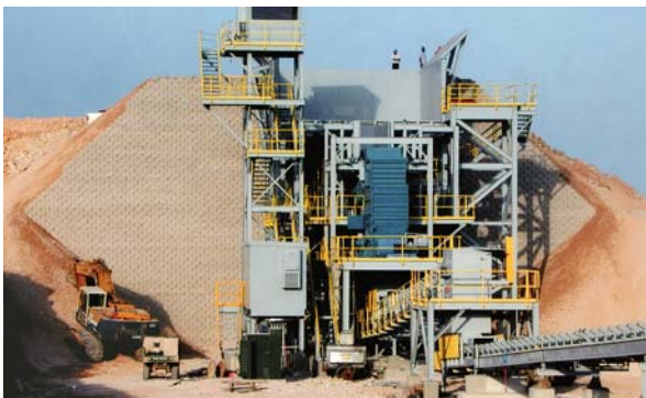
Mesa® Retaining Wall Systems are geogrid-reinforced, integrated systems that can be used to effectively address challenging grade changes at mining sites.

We are happy to supply you with additional information on our geogrid products, installation guidelines, system specification, design details, conceptual designs, preliminary cost estimates, case studies, software and much more. Call 800-TENSAR-1 , e-mail info@tensarcorp.com or visit www.tensarcorp.com .