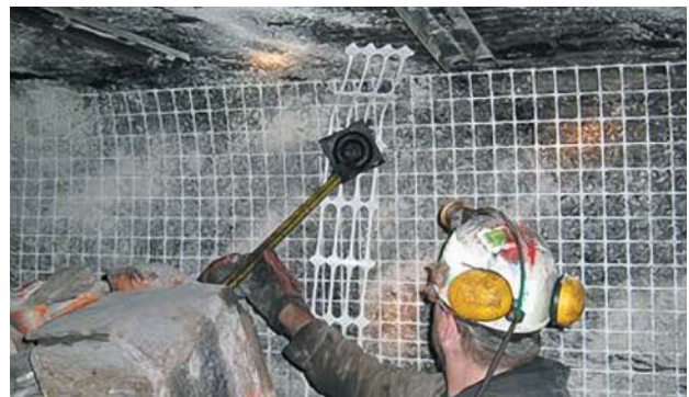
Tensar UX Rib Straps, when combined with Tensar Mining Grid and Minex Rock Mesh, enhances the strength of the underlying mesh.