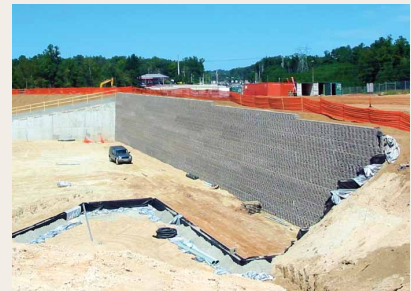
Segmental block wall nearing completion.