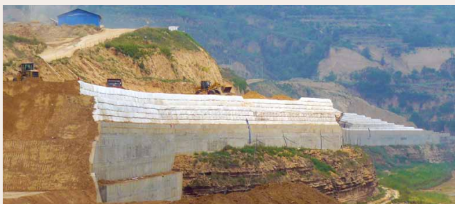
Reinforced soil wall during construction.