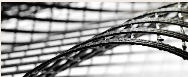
TenCate Miragrid® GX.

Both Miragrid® GX and Polyfelt® PEC are quick and easy to install and work effectively with various types of facing systems. Practical green-facing systems can also be easily adopted to blend in with the surrounding environment.