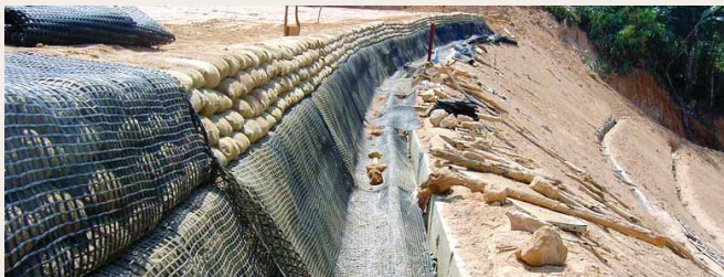
Miragrid® GX geogrids being wrapped around stacked geobags to construct a wall.

This facing system is suitable for slopes with angles up to 80° and heights varying from 3m to 50m. Ground water seepage is controlled by installing a geosynthetic wrapped stone drainage layer at the rear of the reinforced soil structure with the ground water discharged through drainage pipes into surface drains. The completed structure, when vegetated, blends easily with the surrounding environment. It is a proven and cost effective alternative to conventional concrete structures.