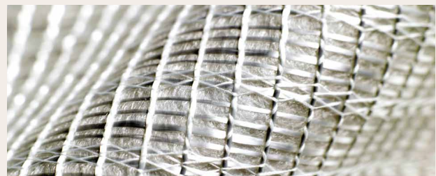
TenCate Polyfelt® PEC.