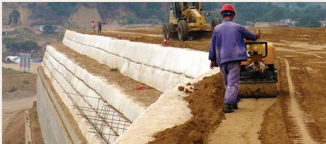
Compacting reinforced fill close to wall face.

Full-height wall facing structures typically comprise of TenCate Polyfelt® PEC (or TenCate Miragrid® GX) reinforced soil mass with full-height concrete facing panels. These concrete panels are typically precast and provide a strong, durable and aesthetic facing, making them ideal for high wall constructions for bridge approaches, highway ramps and major wall structures.