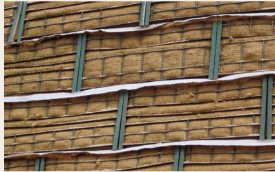
Front of a steep slope with steel mesh formwork facing nearing completion.