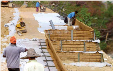
Steel mesh formwork being set-up above layers of Polyfelt® PEC geotextiles.

TenCate Polyfelt® PEC is most commonly used as the reinforcement when the soil mass consists of finer-grained backfill that has poor drainage properties. Alternatively, TenCate Miragrid® GX geogrid is typically used to reinforce coarser-grained soil backfills. This system is ideal for slopes with angles up to 80° and heights ranging from 2m to 25m. It provides a stable facing that blends with the surrounding landscape.