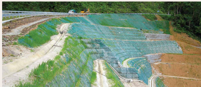
Establishing vegetation onto a completed reinforced slope.

This proven system is a preferred choice for designers and contractors alike because of the easy and rapid construction technique and, especially, its cost effectiveness.