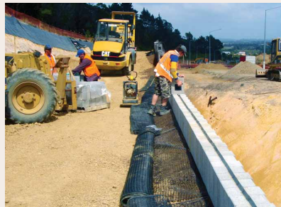
Reinforcing with Miragrid® GX geogrids.

Installation of the block wall facing, geosynthetics and the soil backfill are all in one construction process. Thus, the construction is relatively fast without the need for special lifting equipment and highly skilled labour. Reinforced segmental block walls have become an accepted practice for a fast, durable, aesthetic and cost effective retaining wall. The system is suitable for applications ranging from landscape terraces, housing developments to major structural walls.