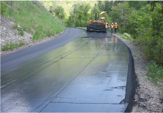
Nebo Loop Scenic Byway

THE CHALLENGE: Utah County needed to bolster the byway, which is closed in the winter, with a quality pavement system that protects against reflective cracking and reduces the maintenance and life-cycle costs of the road. The rugged canyon environment and resulting road layout meant that challenging slope, temperature, dampness and directional factors had to be addressed during the project.