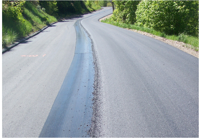
Nebo Loop Scenic Byway