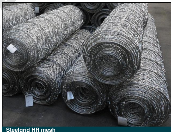
Steelgrid HR mesh