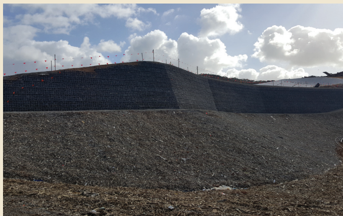
The Completed 105 m Long Reinforced Soil Structure.

The system consisted of pre-fabricated units of double twisted wire mesh stiffened with a welded mesh panel. Two integral pre-formed steel braces maintain the unit to the required slope angle, which in this case was 70 degrees.