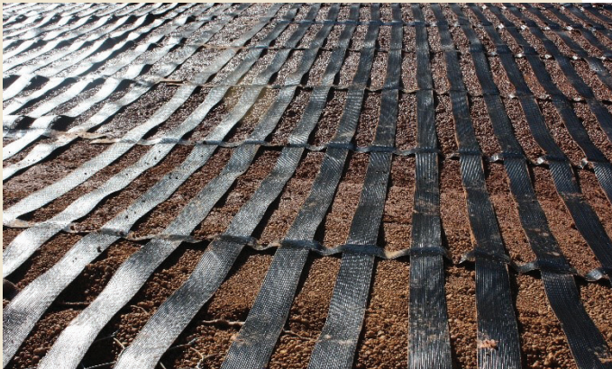
ParaLink geogrids comprise of an open network of integrally connected straps of high tenacity polyester yarn coated with polyethylene.