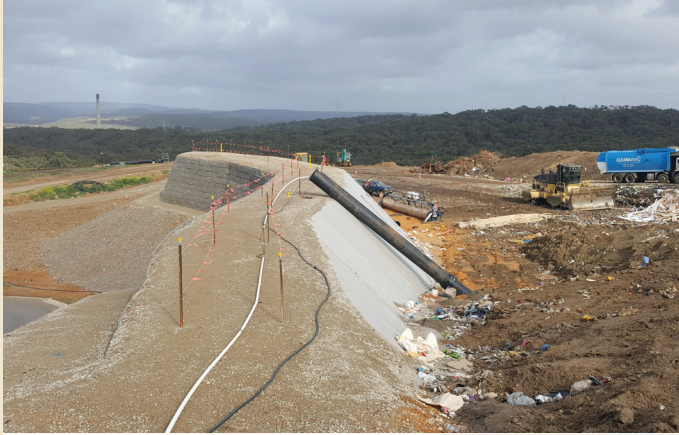
Soon after the Reinforced Soil Structure was completed. Note how the Green Terramesh® System can be used to create curves in the alignment.